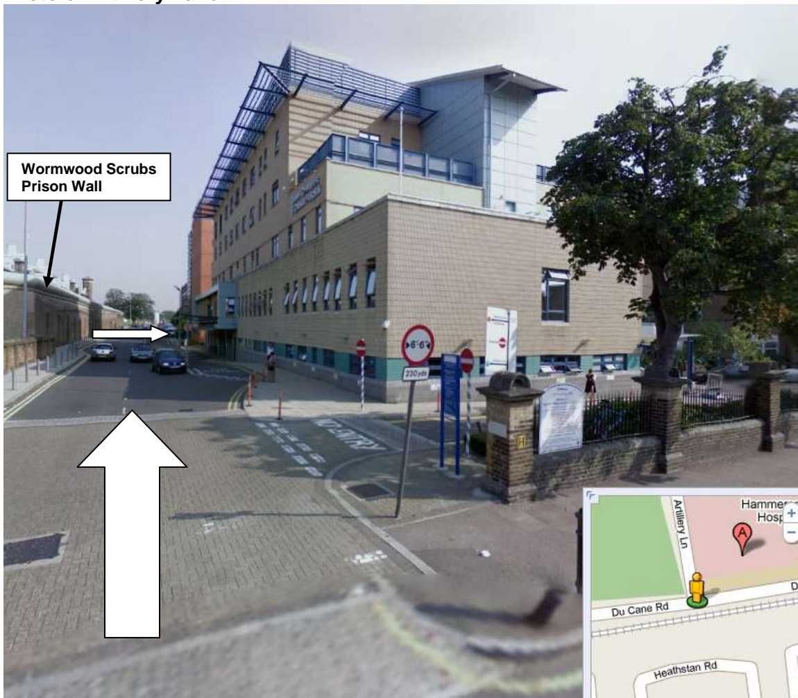
Photo of Artillery Lane

Facing the Hospital site, the Centre is on the very left. Walk along Artillery Lane and you will see, on your right, a narrow car park – turn right just before this and you will come to a gap between two buildings (the venue is signposted from there). Walk through the gap and you should see the venue entrance.