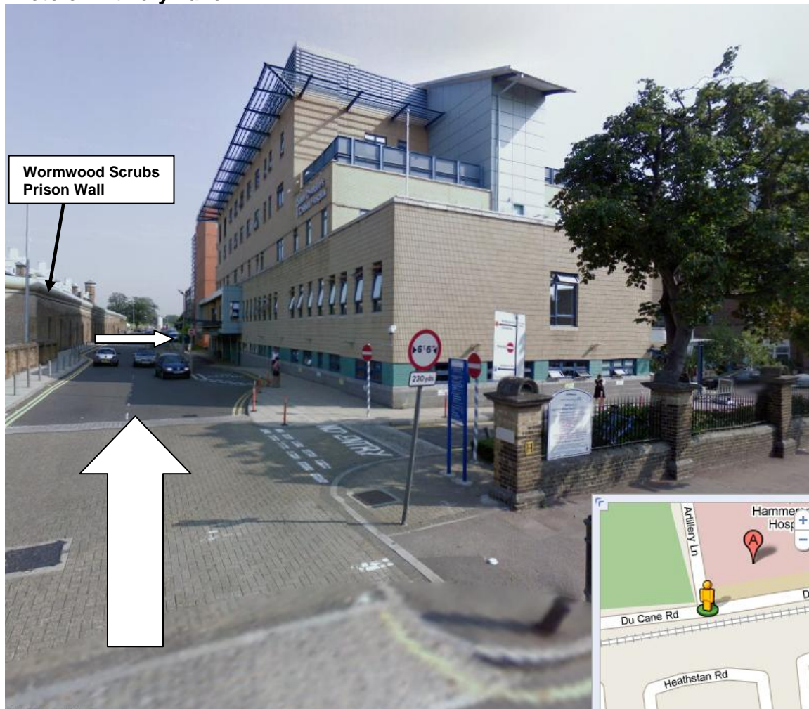
Photo of Artillery Lane

Walk up this road and to the right you will see a narrow car park – turn right just before this and you will come to a gap between two buildings – the venue is signposted from here – walk through the gap and you should see the venue entrance.