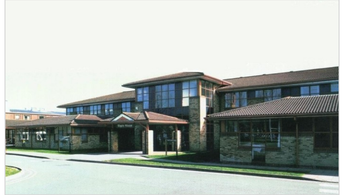
Postgraduate Medical Centre, Maple House ↗

Maple House East Surrey Hospital Canada Avenue Redhill Surrey RH1 5RH Tel: 01737 231722, Fax: 01737 231723